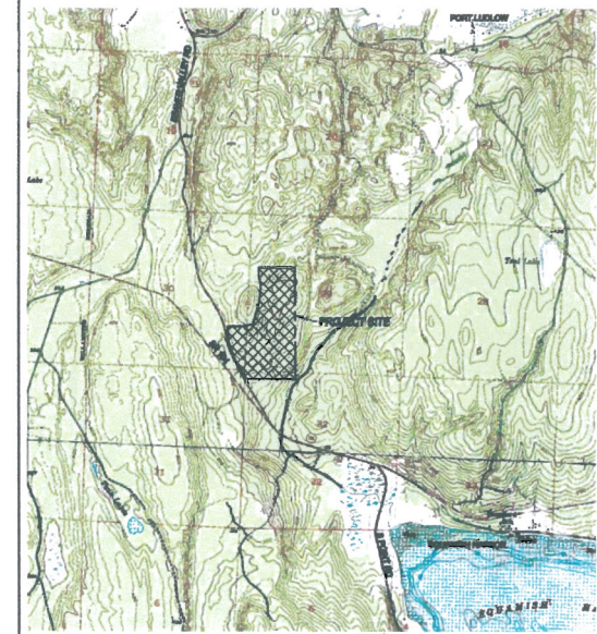
VICINITY MAP SCALE 1" = 2000'